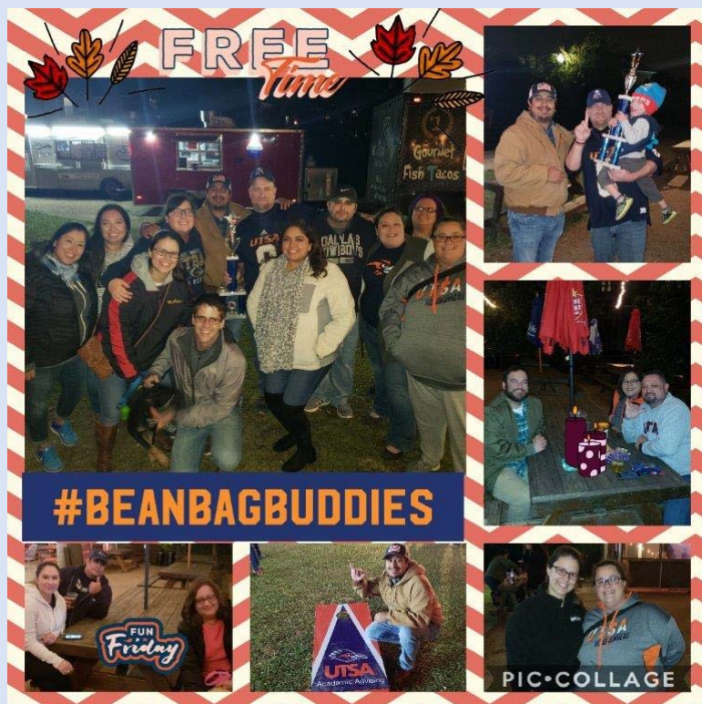
Baggin' the Trophy took home the trophy. Well they definitely bagged it! Congratulations to them for representing the advisors!!